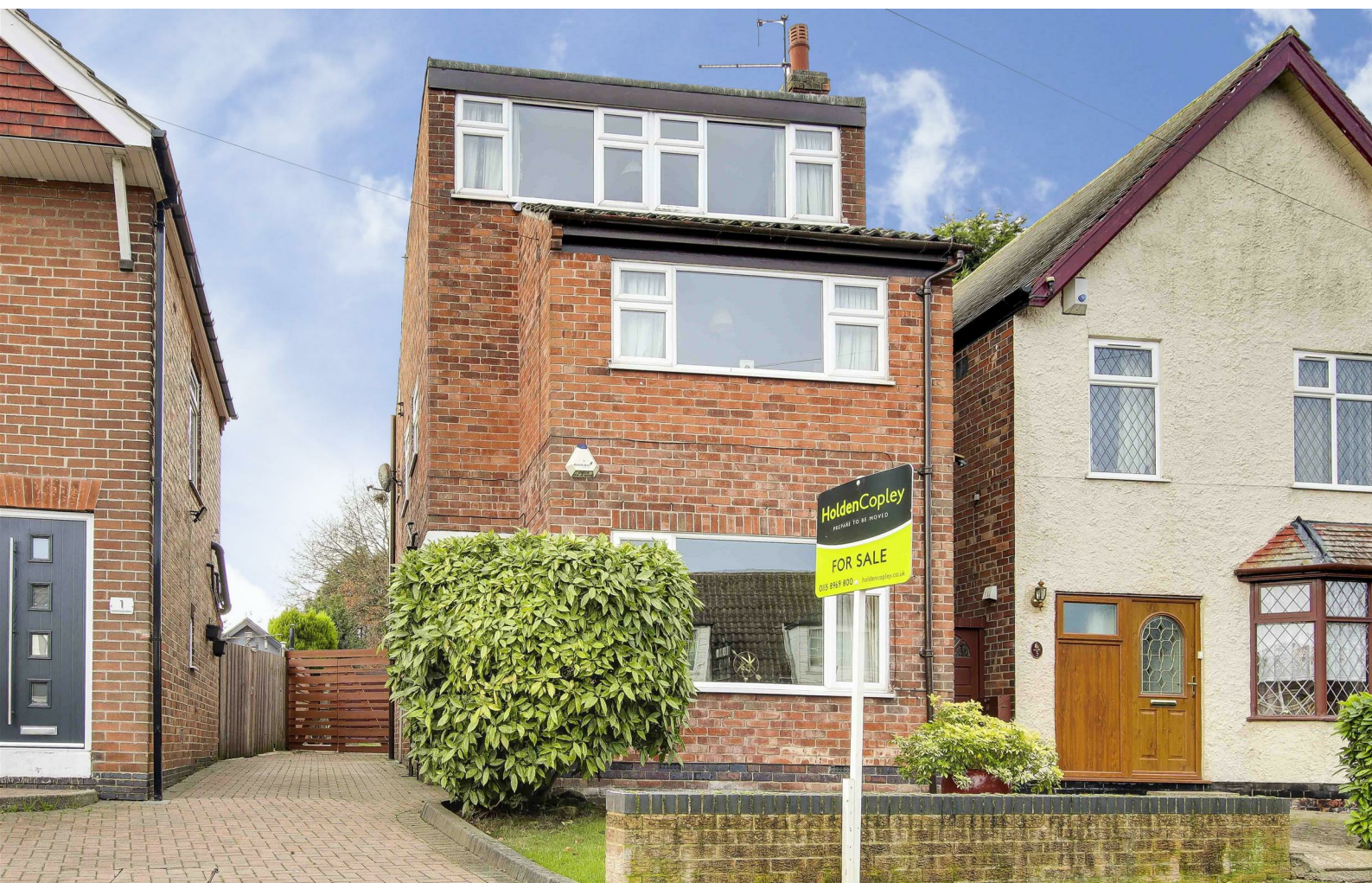
Greenfield Grove, Carlton, Nottinghamshire NG4 1GG